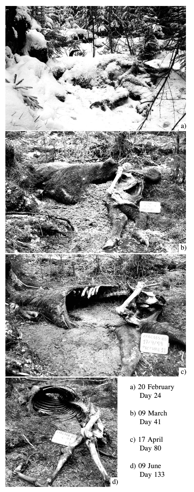
FIGURE 1. Depletion process by scavengers of carcass number 8 during 5 months. This adult bison died in the forest around 27 January 1999. Wolves opened it about 3 weeks later at the upper hind leg and back part. Scavengers first consumed the carcass from inside and later fed on the parts exposed by wolves. In the last stages, the carcass was dragged by wolves and also consumed by invertebrates. Day=days elapsed since bison death.

Once the wolves discovered a bison carcass, they visited it repeatedly, although they did not always feed on it (64% of wolf visits to bison carcasses finished in feeding bouts). On average, wolves visited the same bison carcass 6.6 \pm 4.0 times, and the average interval between consecutive wolf visits to a carcass was 11.6 \pm 13.9 days (mean \pm SD). Foxes, raccoon dogs, ravens, and buzzards were more often recorded during monitoring visits in which wolf feeding occurred. The differences were significant for fox (G-test, G=7.69, df=1, p < 0.01) and raccoon